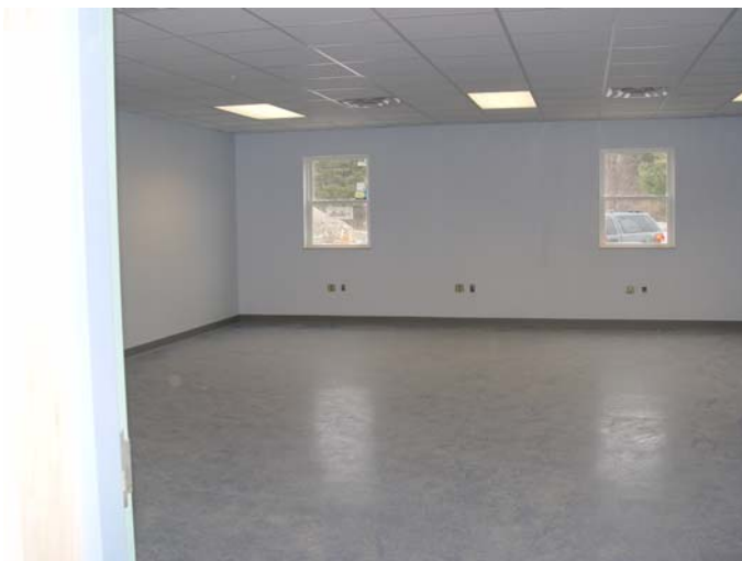
Maine DOT Testing Laboratory Building Freeport, ME